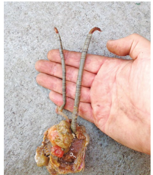
This is what Mediterranean fanworm looks like when out of water.