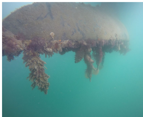
The bottom of the keel bulb of this yacht wasn't cleaned properly before departing from Auckland. Several fanworms and other marine pests were allowed to grow as a consequence.