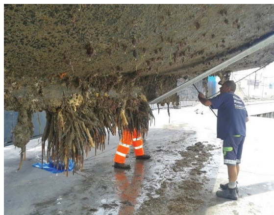
Don't let your boat look like this!

Please try to take photos and record some details, like the name of the vessel and where it was moored, or the location if it was found on the sea floor or on structures.