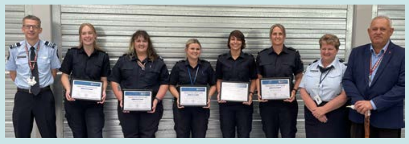
Our latest detector dog handler graduates - qualified and raring to go.