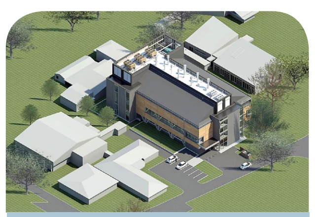
The new facility will sit in the middle of the existing buildings at Wallaceville.

Total capital investment in the project is $87 million.