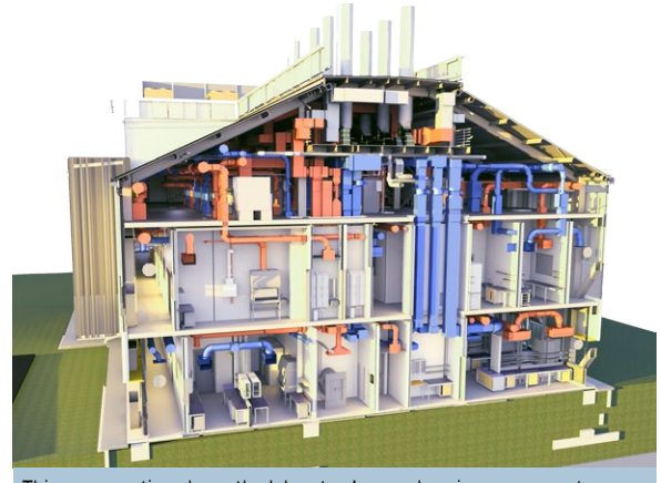
This cross section shows the laboratory's complex air management, hydraulic, and electrical systems that make sure organisms can be handled safely and remain contained.