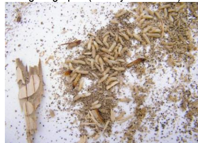
Western Drywood Termite larvae (from vessel)

Please email MPI at seacontainer@mpi.govt.nz if you have any comments or questions about this report, APs or Operators.