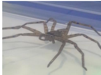
Spider found alive on bananas