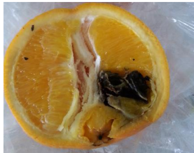
Fungal contamination on imported oranges