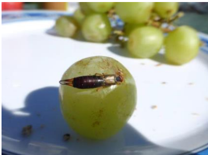
Earwig on grapes (solitary hitch-hiker)

Below are some of the recent biosecurity risk findings from the public 0800 number (0800 80 99 66).