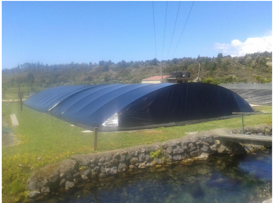
A covered pond at Takaka hatchery to allow photoperiod manipulation.