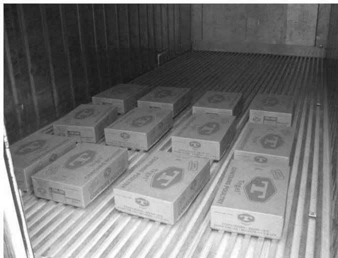
Figure 1: Distribution of boxes in freezer container [boxes 1-4 (top), 5-8 (middle) and 9-12 (bottom) from left to right].

removed from temperature control samples after Day 7 sampling. Air temperatures were also recorded throughout freezing and frozen storage using individual data loggers taped to the inside of box lids and placed in the freezer compartment of the domestic fridge-freezer. Short-term storage was monitored every 6 minutes, while longer term storage under domestic conditions was evaluated every 30 minutes. Temperature data were downloaded using OneWire software and exported to Microsoft Excel for analysis.