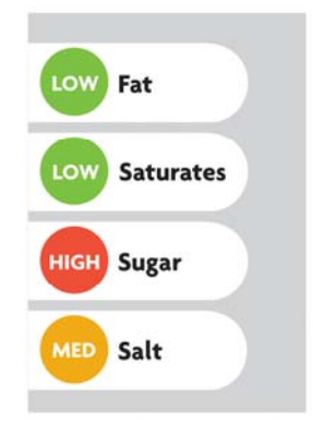
Figure 4: Preferred calorie flags (EUFIC)<sup>14</sup>

Figure 3: Multiple traffic light label (UK)