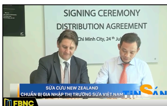
Market Launch in Vietnam