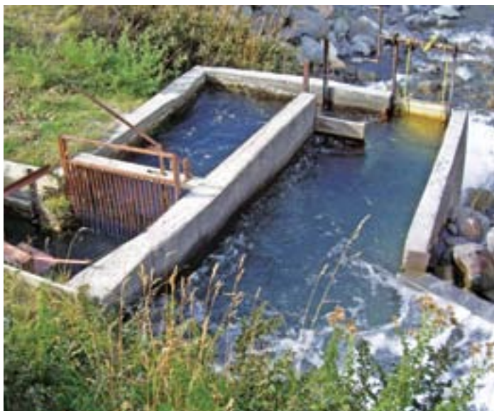
Mini hydro-electric scheme water intake.

It costs around $8–9000 per year to run, including maintenance and