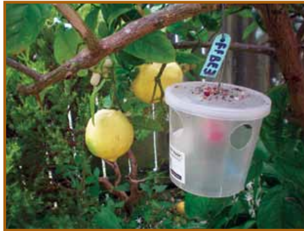
Fruit Fly trap

Export of horticultural produce from New Zealand earned $2.2 billion in 2011. Over 90 percent of the fresh fruit and vegetable exports by value are for produce that could host fruit flies.