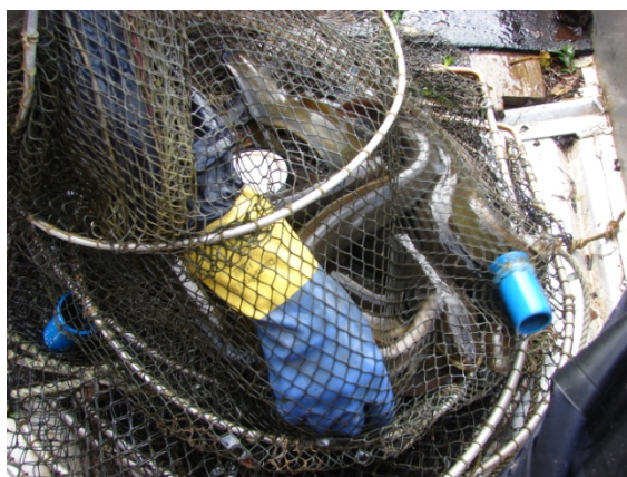
Figure 3. Fyke net with escape tubes.

Fyke nets are the most common commercial fishing method used to catch eels. Commercial eel fishers are required to have at least two escape tubes in their fyke nets (as shown in Figure 3) to allow the escapement of undersize eels (less than 220 g). In the North Island and Chatham Islands, the escape tubes are required to have a minimum diameter of 25 mm. 5 This diameter is substantially smaller than that required for escape tubes on the South Island (31mm), even though the minimum weight limit for eels is the same.