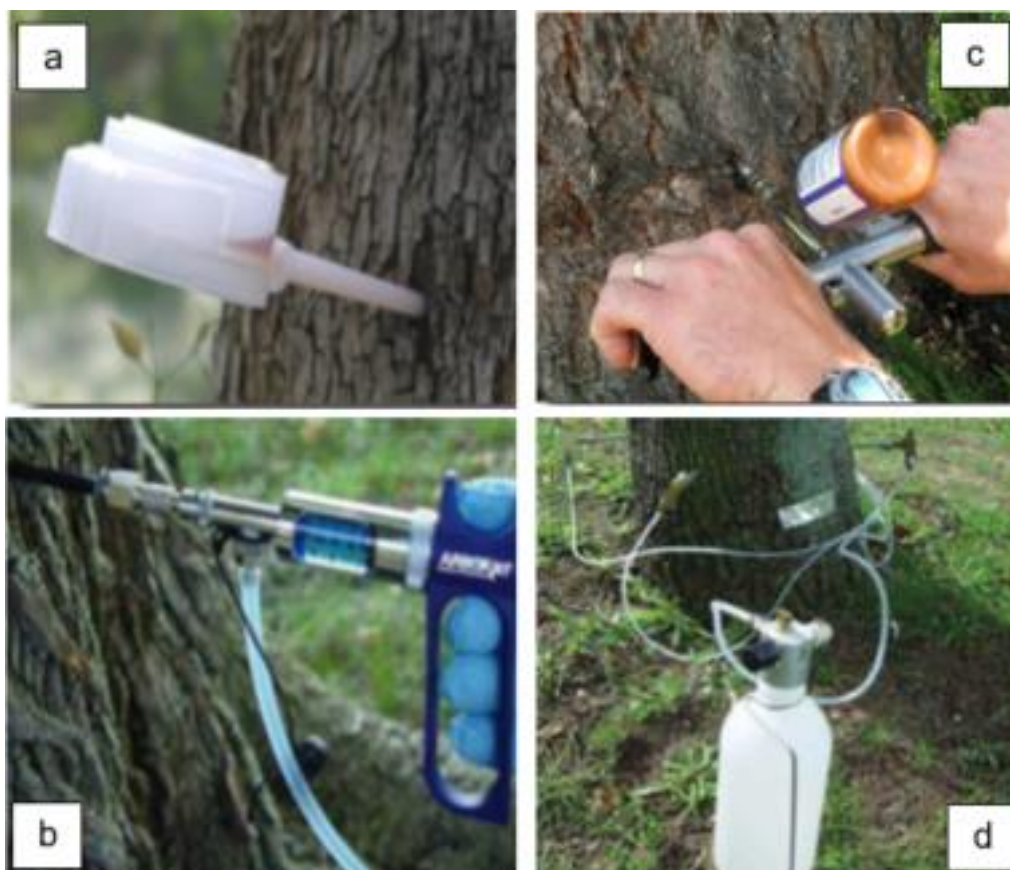
Figure 2. Pictures showing: (a) pressurised capsule injection system, (b) drilled hole injector, (c) injection system without drilled holes, and (d) pressurised reservoir and tubing system.