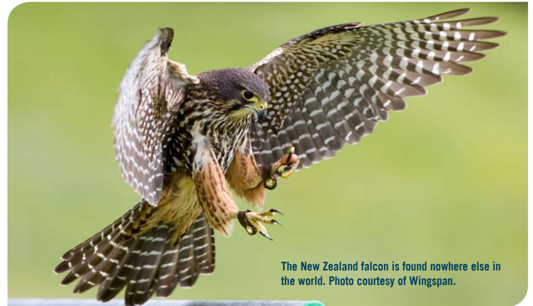
The New Zealand falcon is found nowhere else in the world.

Training can involve many hours depending on the bird. In the wild chicks may spend up to three months with their parents before becoming independent. The longer they have with their parents the more time they have to learn the skills required. When training birds for release they are closely monitored until they are able to fly. Occasionally some birds may never be able to fly or hunt properly and therefore are not able to survive in the wild. These permanently injured falcons become part of Wingspan's breeding programme and their chicks are instead released back into the wild.