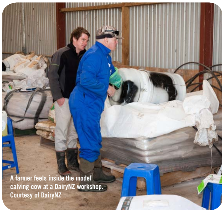
A farmer feels inside the model calving cow at a DairyNZ workshop.

The New Zealand dairy industry comprises approximately 4.6 million dairy cows farmed in around 11,800 herds. Most of these herds are managed on a seasonal calving basis with the majority of calves born in the late winter/early spring period (July to September in New Zealand).