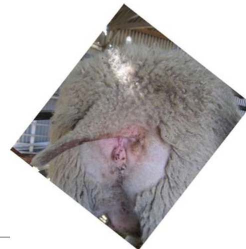
A bare back side and a short tail, the result of genetic selection designed to reduce the need for husbandry procedures in sheep.

David Scobie Animal Productivity Group AgResearch David.Scobie@agresearch.co.nz