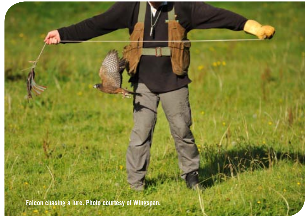
Falcon chasing a lure.

The rehabilitation of injured New Zealand falcons uses ancient and traditional techniques of falconry to ensure that birds released back into the wild are fit and able to survive.