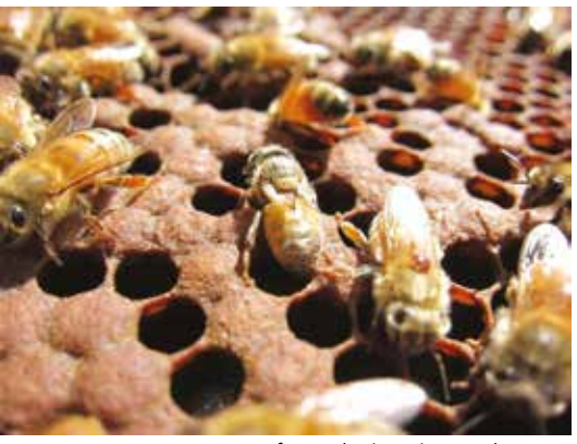
Deformed wing virus and varroa.