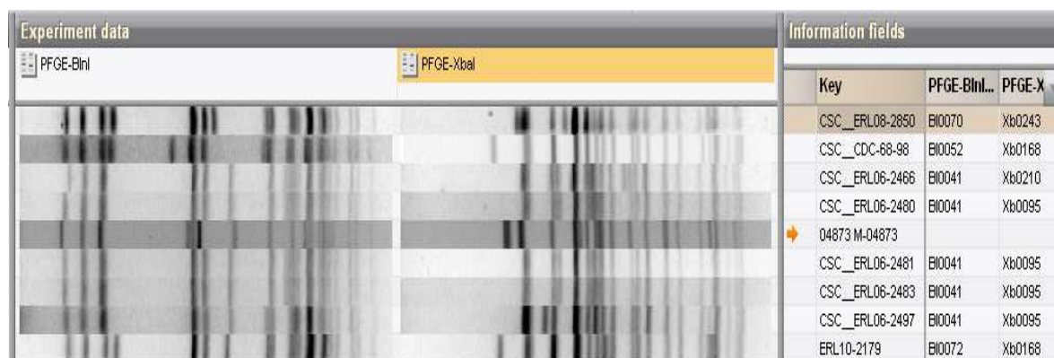
Figure 4. Comparison New Zealand patterns with USA isolate M-04873