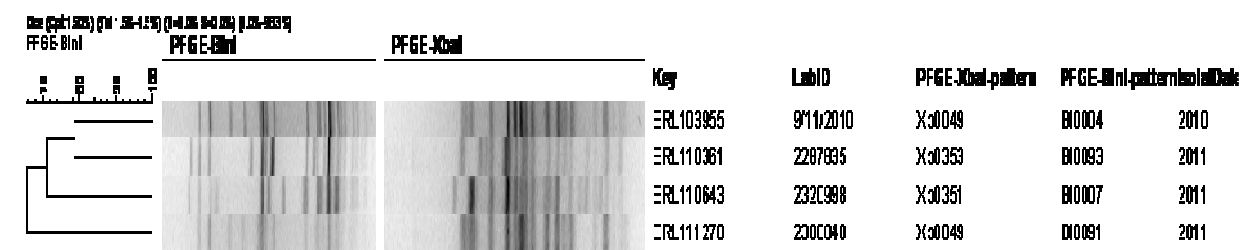
Figure 3. Comparison of four New Zealand isolates

Query 1: In May 2011, Nicola Dermer (MPI) asked as to whether four isolates from the same premises/lab, were of the same genotype. Comparison of PFGE patterns identified that they were all distinguishable from each other (Figure 3). There was also some variability in the STEC PCR and H7 results.