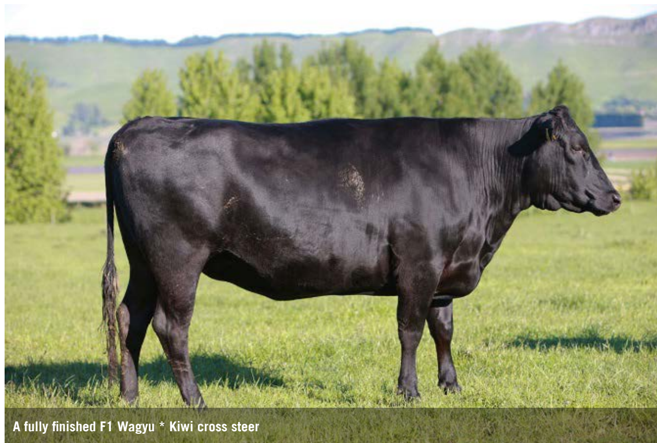
A fully finished F1 Wagyu * Kiwi cross steer

Meanwhile, the position in the London market has been consolidated with the appointment of a Category Manager to lead the business forward. In the United Arab Emirates, sales are underway through the distribution facility and retail outlet owned by Firstlight Foods, with demand for the product strong across all key markets.