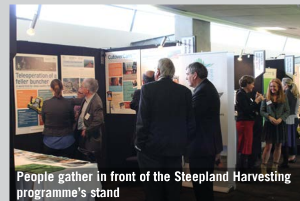
People gather in front of the Steepland Harvesting programme's stand

The Steepland Harvesting programme aims to improve productivity and worker safety by developing and