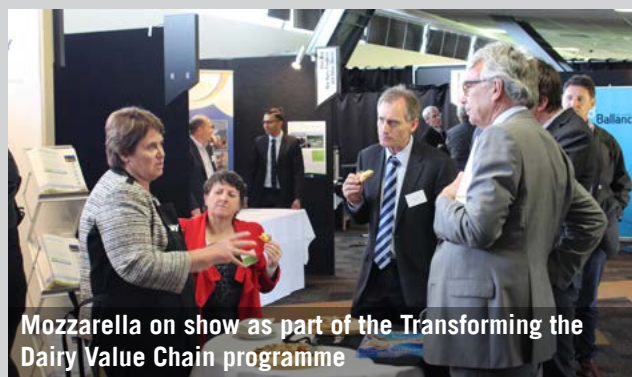
Mozzarella on show as part of the Transforming the Dairy Value Chain programme