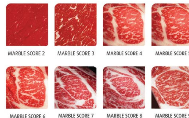
Marbling Score Grading – chart showing intramuscular fat grading for Grass-fed Wagyu