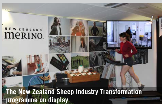
The New Zealand Sheep Industry Transformation programme on display