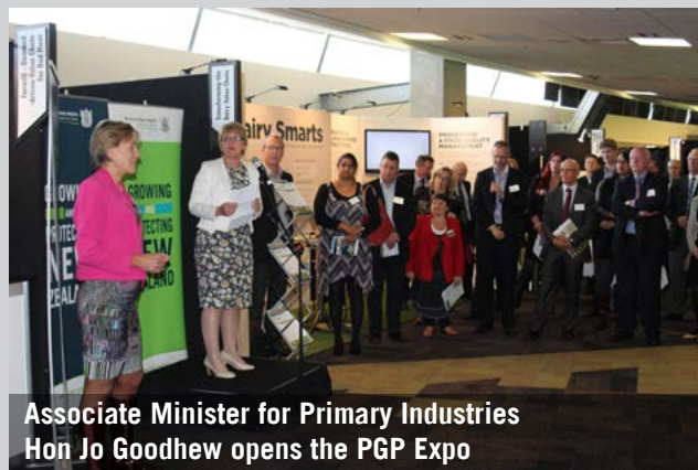
Associate Minister for Primary Industries Hon Jo Goodhew opens the PGP Expo