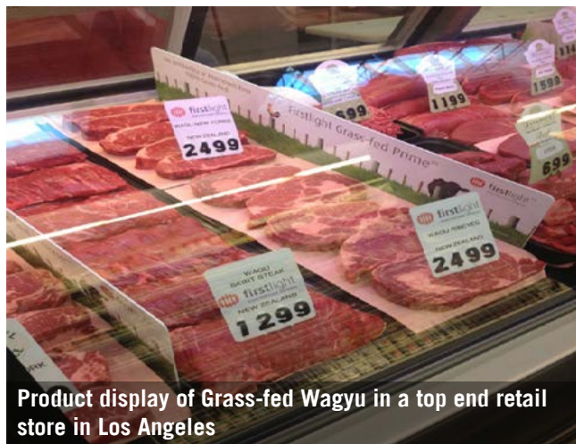
Product display of Grass-fed Wagyu in a top end retail store in Los Angeles