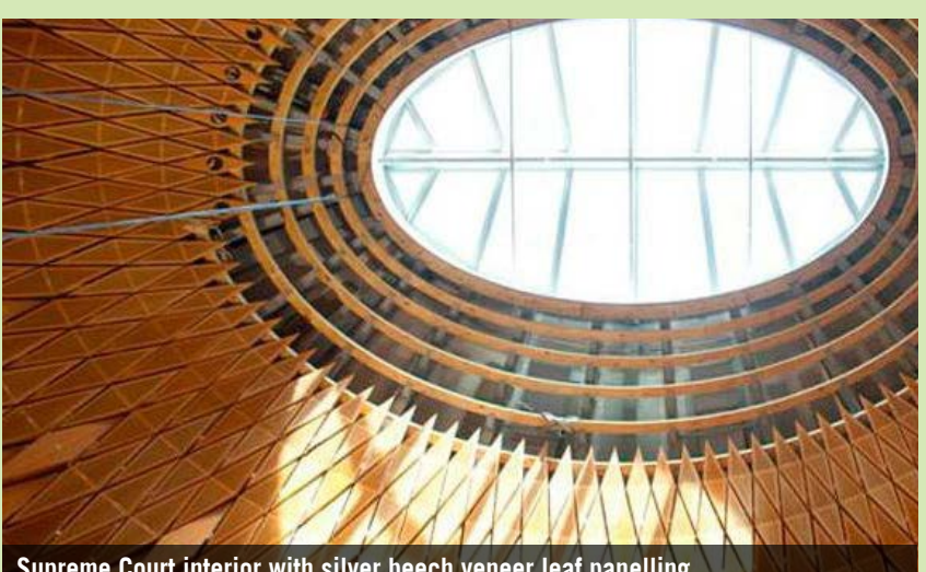
Supreme Court interior with silver beech veneer leaf panelling.