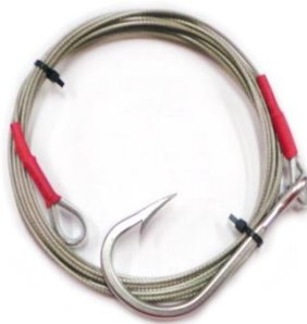
Figure 2: Wire trace with hook

Wire traces are also unlikely to be used for a similar reason in that they increase the number of sharks caught and make the release of live sharks more difficult. Sharks will often be able to bite through nylon traces and avoid capture. Although the hook remains in the animal, it avoids the stress and harm that comes from additional time on the line and further handling by fishers which all contribute to the survivability.