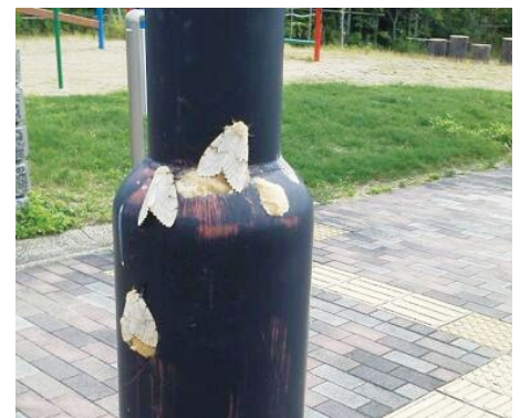
Asian gypsy moth and egg mass

www.mpi.govt.nz/importing/border-clearance/vessels/