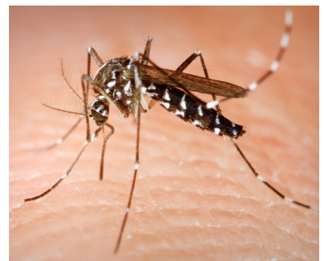
Asian tiger mosquito